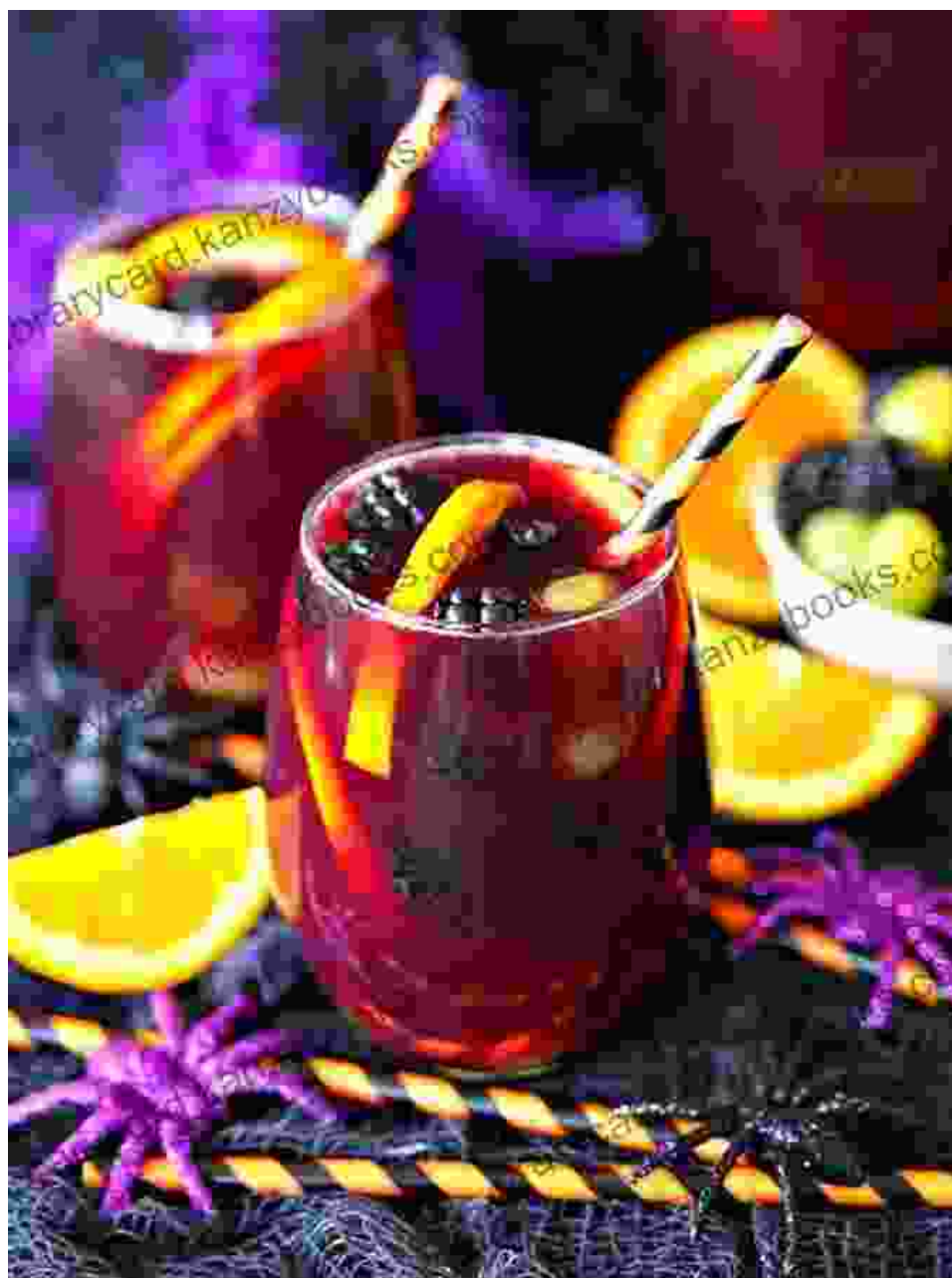
Table of Terror: Spine-Tingling Settings to Haunt Your Guests

Sip on the enigmatic "Witches Brew" or dare to try the intoxicating "Poison Apple Martini." Each sip promises a journey into the unknown, where flavors dance on the edge of the macabre.