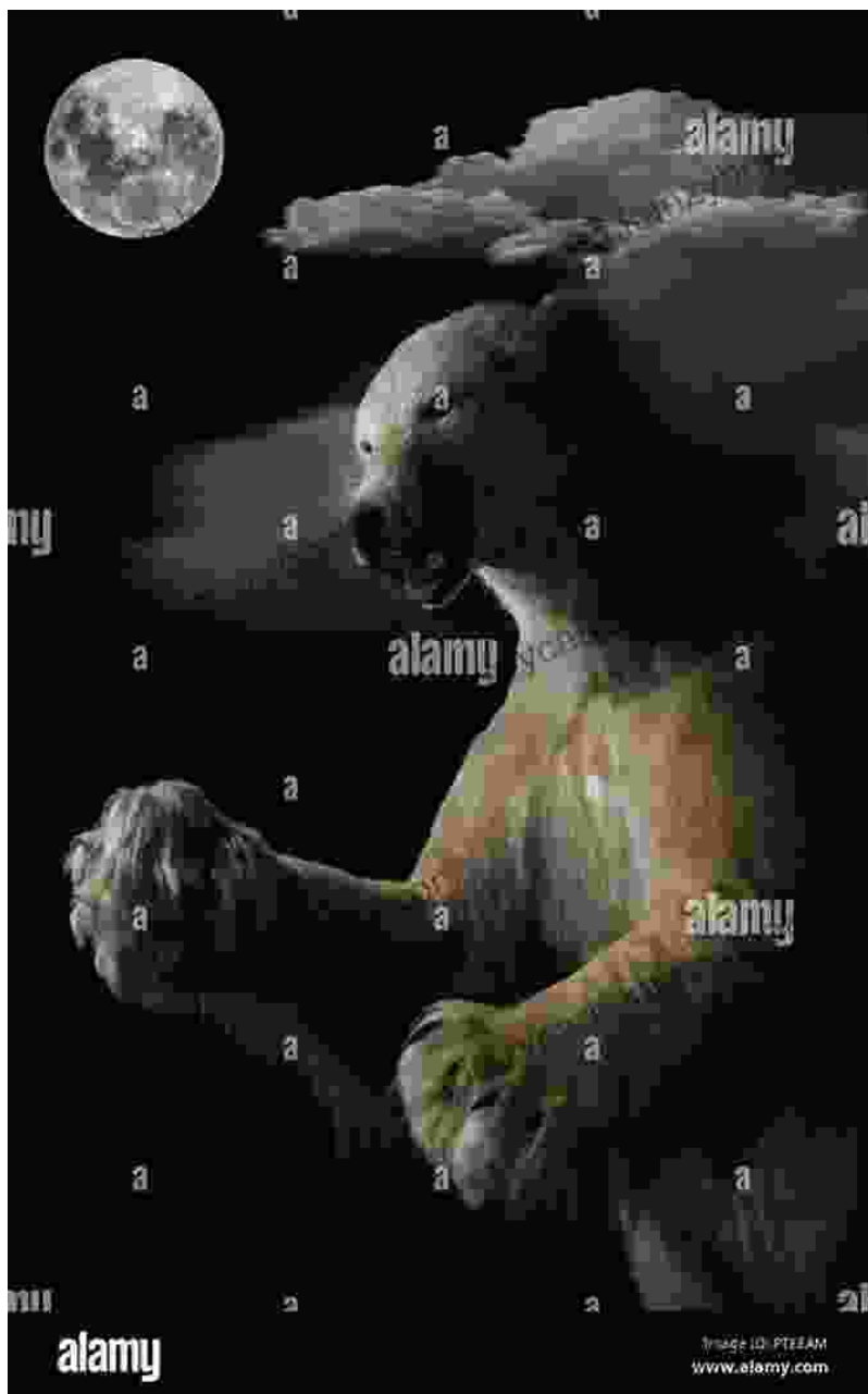
Bear's Magic Moon (Picture Flats) by Brian Rathbone